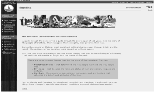
GreenSpace community website competiton winner: Friends of General Cemetery - www.gencem.org

Increasing numbers of community groups are finding that websites are an excellent method of promoting their group and keeping members and other interested parties informed. You should think carefully whether a website would be appropriate and useful for your group as it will be a time consuming project and could involve a small financial investment. The benefits can be enormous, however, and GreenSpace have produced a guidance document describing how to go about setting up your own website, which can be downloaded for free by visiting www.green-space.org.uk.