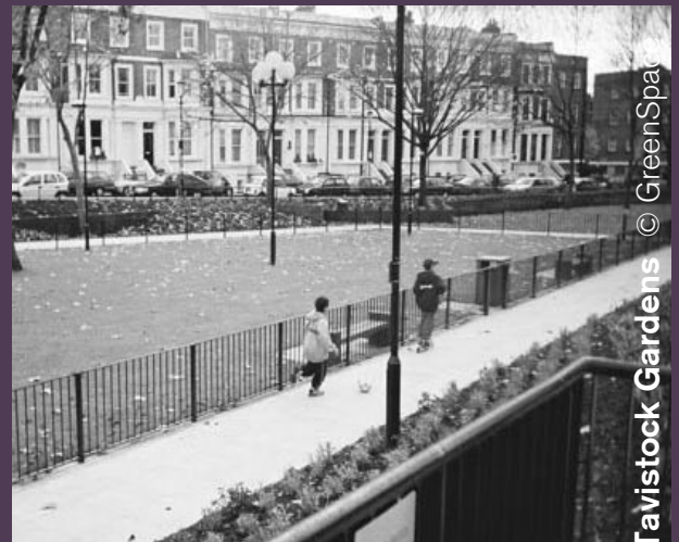
Tavistock Gardens

The park has now been regenerated with provision for all sectors of the community, including target groups, the elderly and young children, and was reopened to widespread acclaim in the community and council.