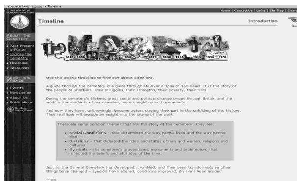
GreenSpace community website competition winner: Friends of General Cemetery - www.gencem.org

Increasing numbers of community groups are finding that websites are an excellent method of promoting their group and keeping members and other interested parties informed. You should think carefully whether a website would be appropriate and useful for your group as it will be a time consuming project and could involve a small financial investment. The benefits can be enormous, however, and GreenSpace have produced a guidance document describing how to go about setting up your own website, which can be downloaded for free by visiting www.green-space.org.uk .